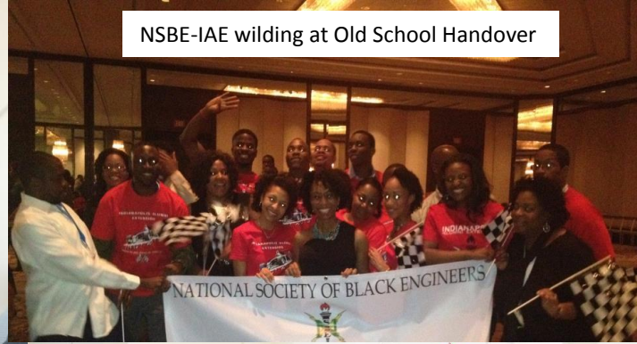
NSBE-IAE wilding at Old School Handover