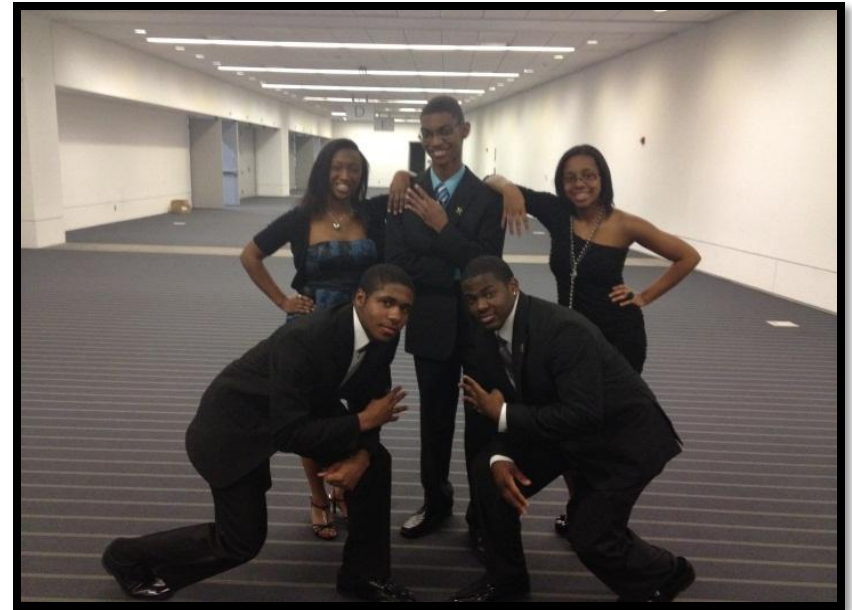
4 Solid! Fo' Life! Forever!!! (Region 4 Chant)

continue to stay focused. Unfortunately, in the second round they were not able to have the luck of the draw, and two questions set them back. San Antonio, Northland Nation Gold, and Northland Nation came out as the winners for the second round of the quiz bowl. At the end, they still received many congratulations for the hard work and achievements that they had along the way. They still had fun, and they know that everyone is still proud of them. They are excited to compete next year and cannot wait for the 39 th Annual Convention that will be held in their hometown of Indianapolis, Indiana. Congratulations Indy TMAL!