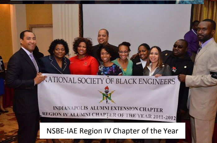
NSBE-IAE Region IV Chapter of the Year