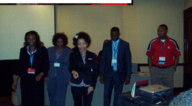
NSBE-IAE Teaching rest of Region IV our line dance