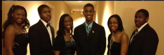
TMAL dressed for a night of elegance